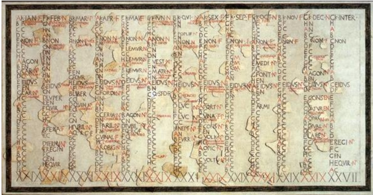
Fasti Antiates – reconstruction of the only known pre-Julian calendar in existence.

This calendar was painted on plaster with the letter A painted red to indicate the start of the week. The months are arranged in 13 columns. January, on the left, begins on day “A” and ends on day “E”. At the bottom of each column are large Roman numerals showing the number of days in that month. The far right hand column is the 13 th , intercalary month. Additional letters appear beside the week-day letters. These indicated what sort of business could or could not be conducted on that day.